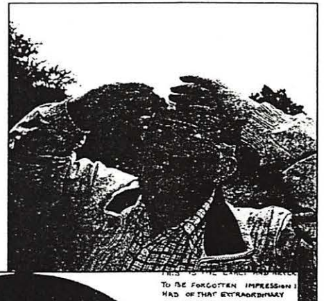
THIS TO THE LEFT AND BELOW TO BE FORGOTTEN IMPRESSION I HAD OF THAT EXTRAORDINARY CRAFT, WHEN IT WAS JUST 18ft ABOVE MY HEAD ON THAT BLAZING HOT DAY IN JULY 1955.

"I could still take you to the exact spot. I don't know how long we watched for but I got told off for being late home for tea. I told my parents but they thought I was crackers."