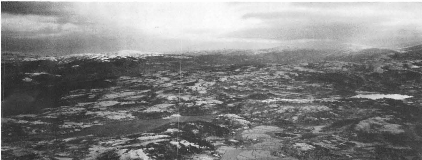
This is the Hessdalen Valley in central Norway, site of numerous 'lights in the sky.'

A major new mystery has been catapulted into ufology (not that all of ufology isn't a mystery!) It concerns NL's (Nocturnal Lights) or, if you wish, LITS (Lights in the Sky) which have captured the attention of Norwegian ufologists and their associates in neighboring countries. While such lights may be explainable as "earthlights" or lights generated by electromagnetic fields associated with geologic faults (an explanation that is growing in popularity) the question is left open as to why these lights have only recently appeared in these locations in relative profusion and why there appear to be associated with the sightings of lights, also sightings of "craft" with definitely outlined shapes.